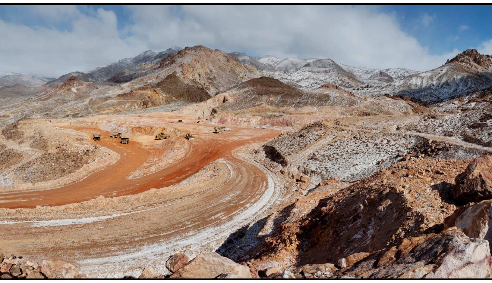
Isabella Pearl, Nevada Mining Unit