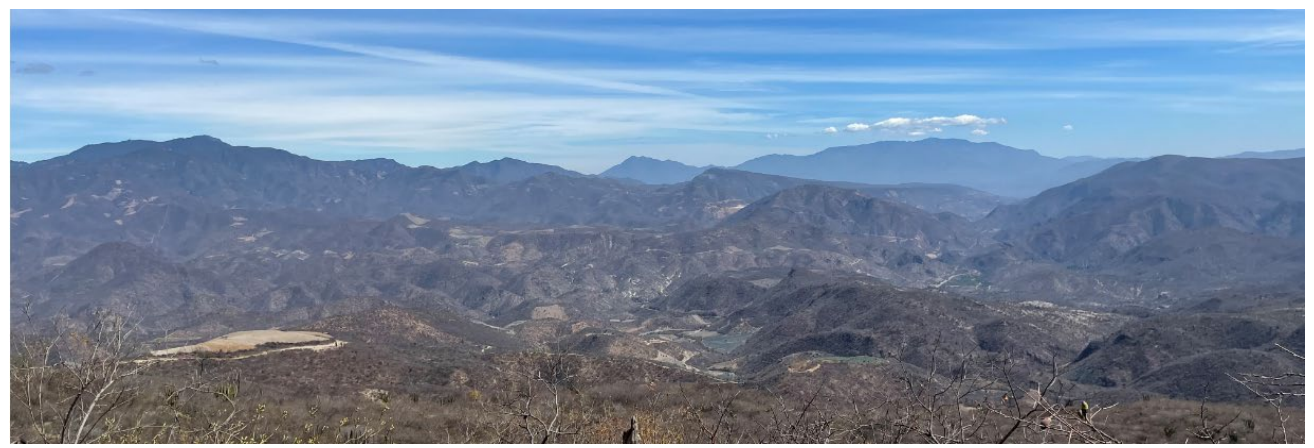
View from Alta Gracia southeast towards Aguila

Within the 55-kilometer structural corridor sits a highly prospective ground package. Multiple volcanic domes of various scales, and likely non-vented intrusive domes, dominate the district geology. These volcanogenic features are imposed on a pre-volcanic basement of sedimentary rocks. Gold and silver mineralization in this district is related to the manifestations of this classic volcanogenic system and is considered epithermal in character. We intend to unlock the value of the mine, existing infrastructure, and our large property position by continuing to invest in exploration and development and advance organic growth.