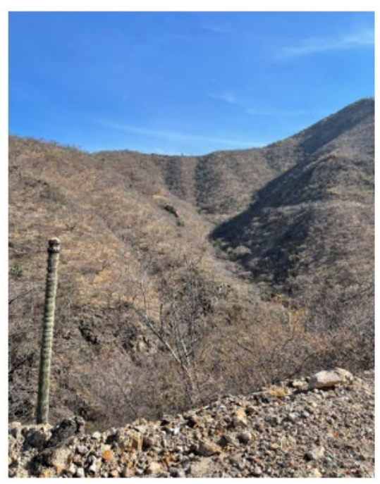
Southern and Northern ends of Aguila Concessions.