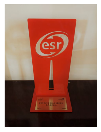
Sixth consecutive ESR award

We completed thirty-eight underground diamond drill holes totaling 9,471 meters and 7 surface diamond drill holes totaling 3,180 meters at the Aguila project during 2020. Our exploration activities were mainly focused on exploration drilling at the Arista and Switchback vein systems in the Arista Mine. The Switchback vein system extends for over a one kilometer strike length and remains open on both strike and vertical extent. The drill program focused on the Switchback vein system and targeted the expansion and delineation of multiple high-grade parallel veins to define additional mineral reserves and optimize the mine plan. Likewise, we continued to explore extensions of the Arista vein system currently in production. Surface geologic mapping and rock chip sampling also continued in the vicinity of the Arista Mine, the Aguila open pit and the geological targets