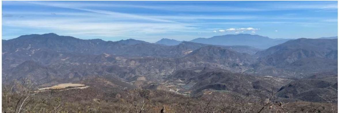
View from Alta Gracia southeast towards Aguila

Within the 55-kilometer structural corridor sits a highly prospective ground package. Multiple volcanic domes of various scales, and likely non-vented intrusive domes, dominate the district geology. These volcanogenic features are imposed on a pre-volcanic basement of sedimentary rocks. Gold and silver mineralization in this district is related to the manifestations of this classic volcanogenic system and is considered epithermal in character. We intend to unlock the value of the mine, existing infrastructure, and our large property position by continuing to invest in exploration and development and advance organic growth.