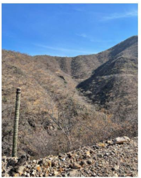
Southern and Northern ends of Aguila Concessions.