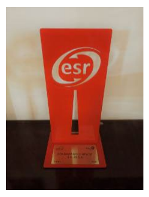
Sixth consecutive ESR award

We completed thirty-eight underground diamond drill holes totaling 9,471 meters and 7 surface diamond drill holes totaling 3,180 meters at the Aguila project during 2020. Our exploration activities were mainly focused on exploration drilling at the Arista and Switchback vein systems in the Arista Mine. The Switchback vein system extends for over a one kilometer strike length and remains open on both strike and vertical extent. The drill program focused on the Switchback vein system and targeted the expansion and delineation of multiple high-grade parallel veins to define additional mineral reserves and optimize the mine plan. Likewise, we continued to explore extensions of the Arista vein system currently in production. Surface geologic mapping and rock chip sampling also continued in the vicinity of the Arista Mine, the Aguila open pit and the geological targets Cerro Pilon and Cerro Colorado amongst other prospects of the Aguila project. Our exploration efforts demonstrate our commitment to long-term investment in Oaxaca, Mexico.